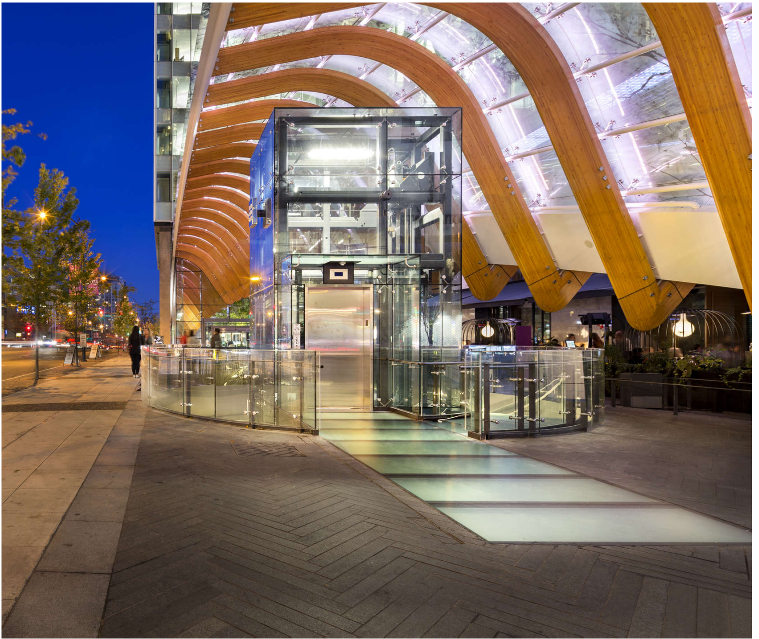
Jury Award & Popular Choice Award: TELUS Garden Office Tower by Henriquez Partners Architects