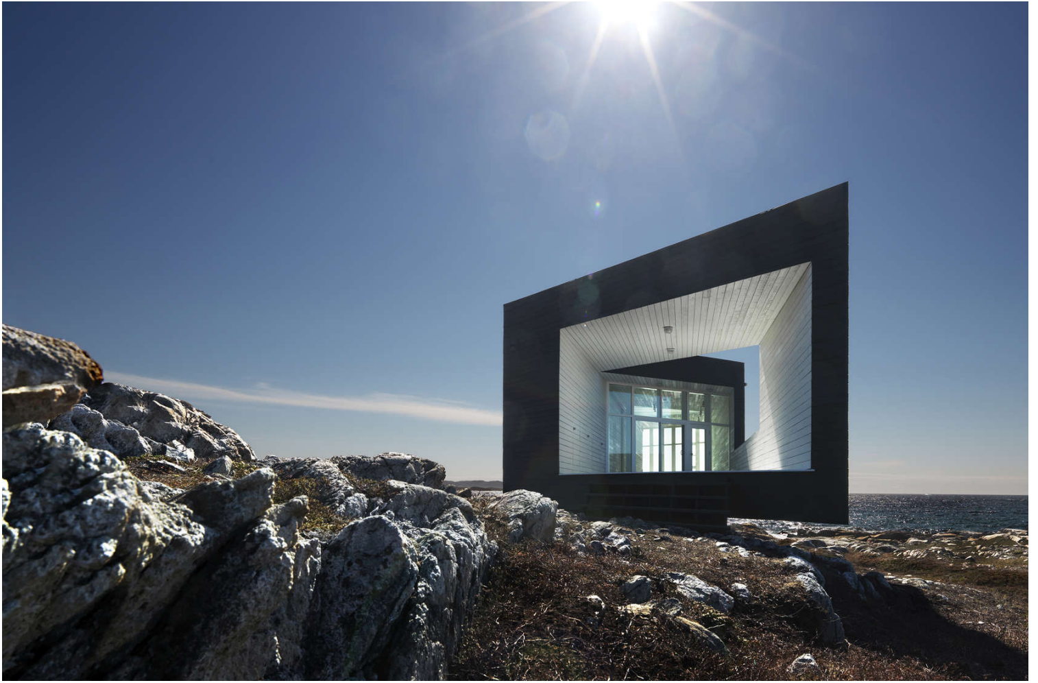
Jury Award: Fogo Island Artist Studios by Saunders Architecture