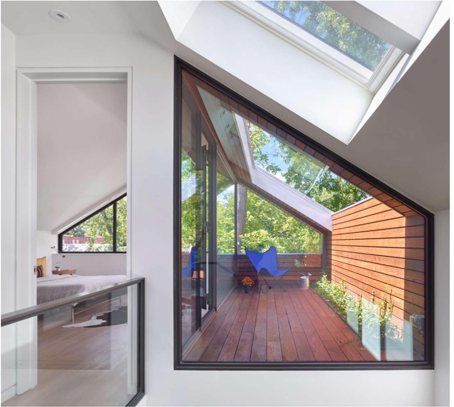
Popular Choice Award: Skygarden House by DUBBELDAM Architecture + Design