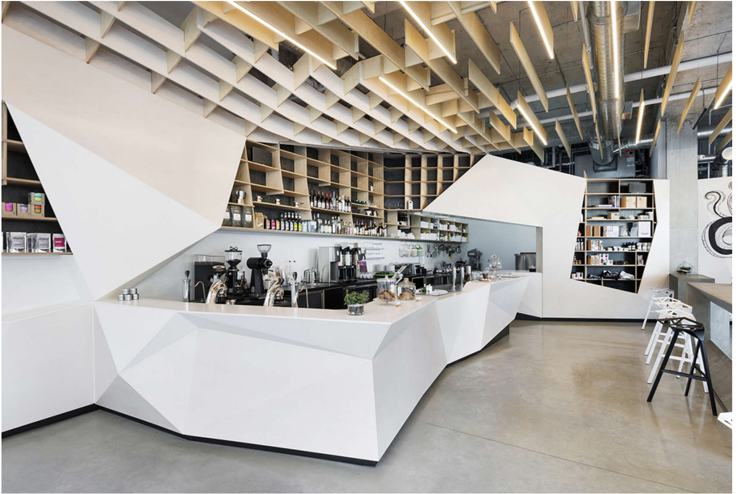
Popular Choice Award: Odin Bar + Cafe by Phaedrus Studio