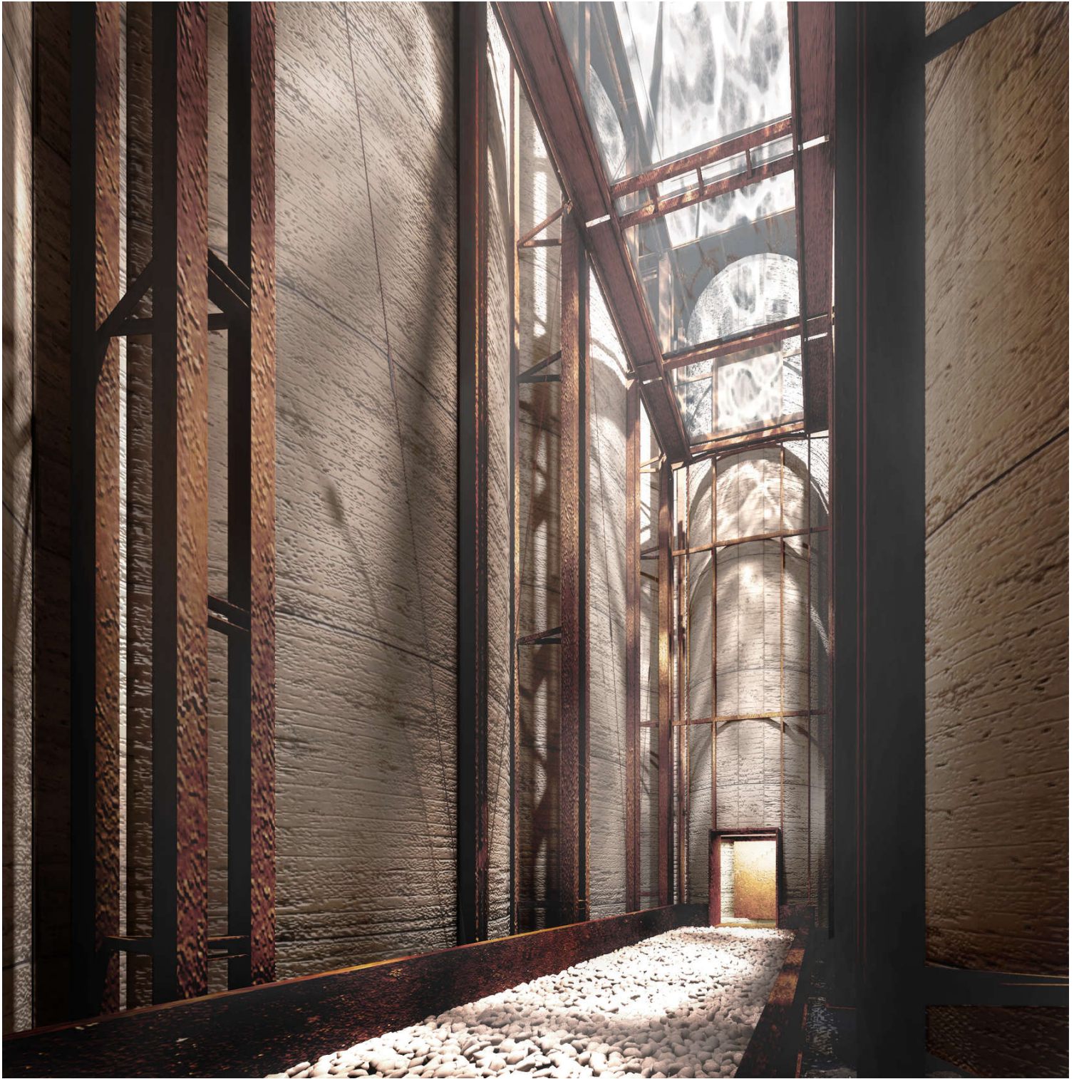
Jury Award & Popular Choice Award: Anti-Museum by Diamond Schmitt Architects/Student Project