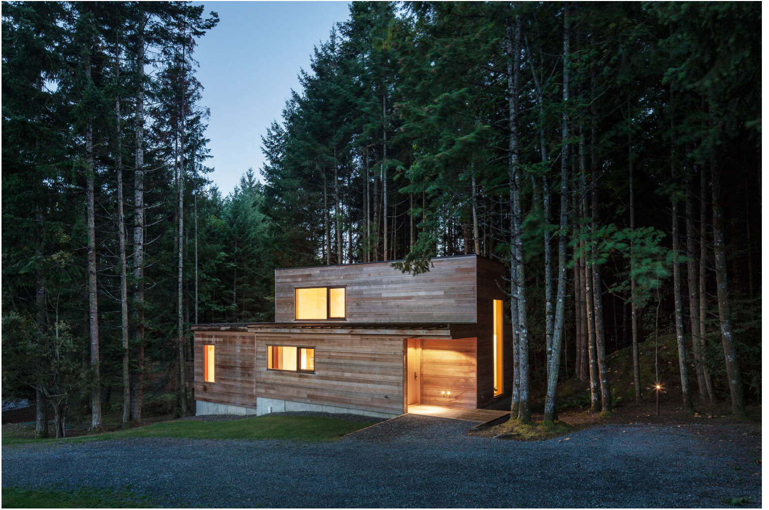
Popular Choice Award: Rainforest Retreat by AGATHOM Co.